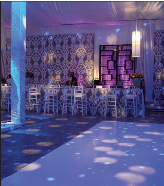
Gloss Bright White #112 GamFloor™ is applied to wooden dance floor for wedding reception.