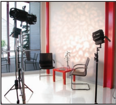
112 Gloss Bright White