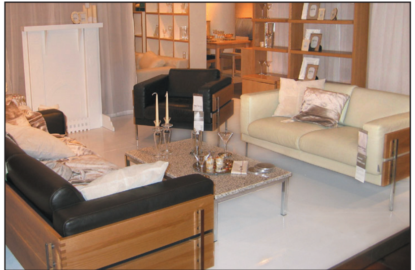
Gloss Bright White #112 for retail display