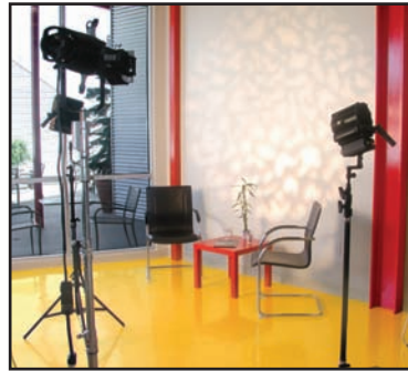
142 Gloss Bright Yellow