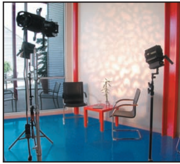
172 Gloss Deep Blue