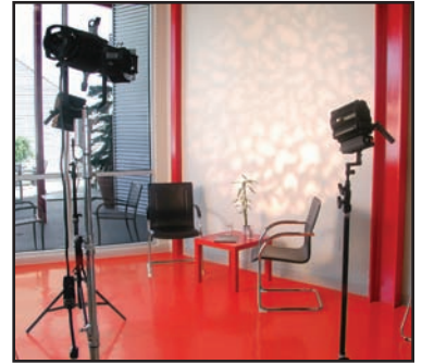
154 Gloss Red Carpet